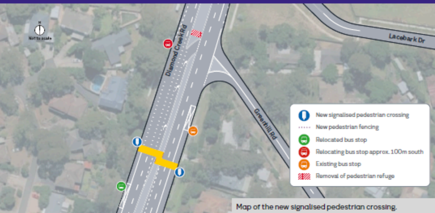
Map of the new signalised pedestrian crossing.