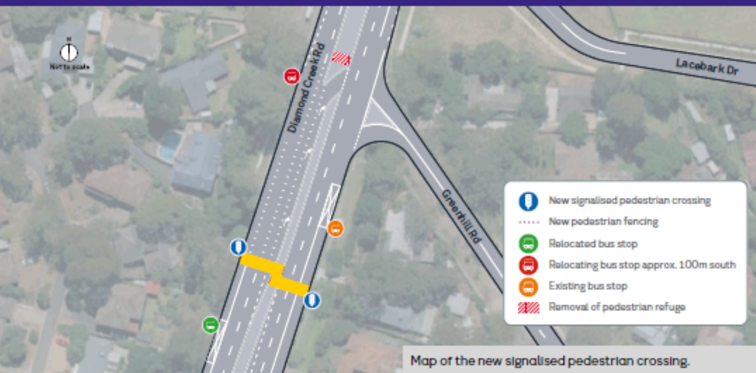
Map of the new signalised pedestrian crossing.