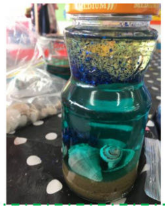
Beach in a Jar