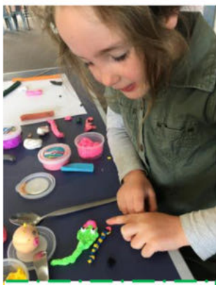
Making Clay Animals for Claymation Video

Look at all the fun activities we have been up to!